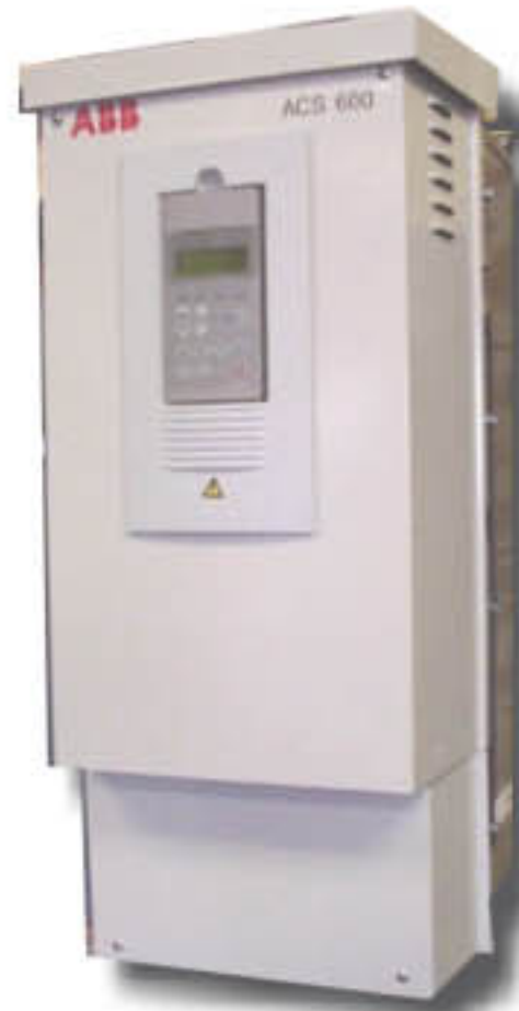
ABB ACS 611 Power Processor AC output at 480 VAC, 3-Phase, Grid-Connected or Off-Grid

The XL.50 is best suited for small businesses in high electricity cost areas and for larger remote facilities and villages.